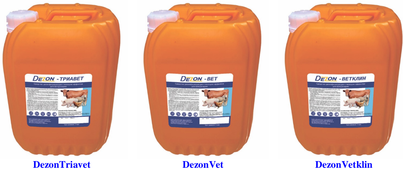
Figure 1: Disinfectants manufactured by LLC Dezon

The studies were in the Federal Center for Animal Health and the St. Petersburg State University of Veterinary Medicine. In the experiment, there were three disinfectants manufactured by LLC Dezon (Figure 1).