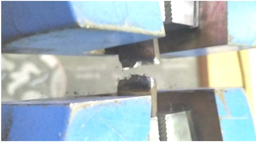
Figure 3: Specimen failure under Tensile Loading (created by authors).