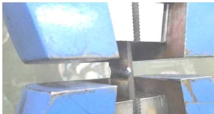
Figure 2: Tensile Test 1 Plate Size 25X4 mm, length 100mm S30430. (created by authors).