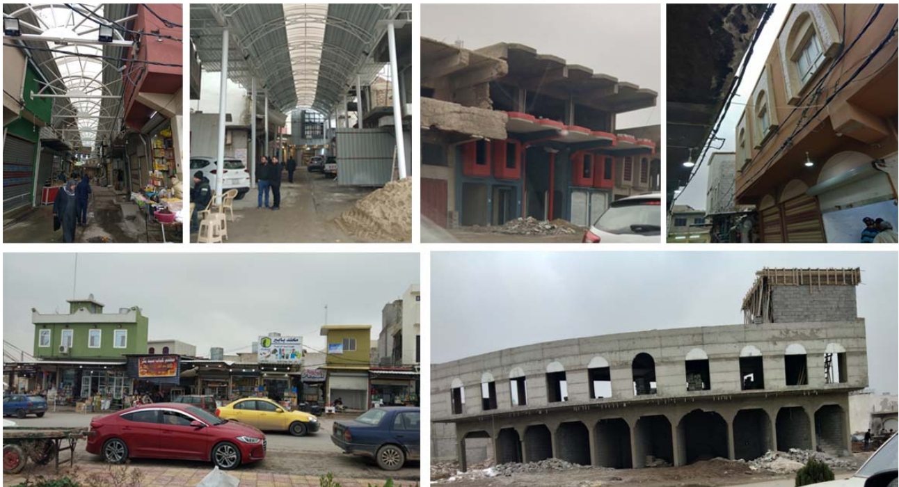
Figure 5: Images from Old Mosul City shows the techniques of renovating, reconstructing, and rehabilitating heritage building.

The results of visual observation of the heritage buildings in old Mosul city show the lack and imperfect matching between the interior design of the heritage buildings and the exterior design. The exterior design of the heritage building is represented by the architectural facades of the heritage buildings, which are simple with few details. Most of the renovation processes focused on the exterior facades. The interior facades and details shifted from the original one using strange materials, elements, and forms. The extreme use of color painting in the interior facades and details, which are strange colors, impact the identity and heritage value of the old Mosul city. Orange, purple, ping, and nave blue color are newly used in the painting of the interior and exterior surfaces, which sometimes covered the original materials such as stone, marble, and finishing texture (figure 5).