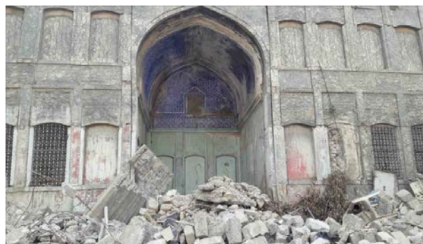
Figure 1: A sample of partially destroyed heritage houses in Old Mosul City (Wakalat, 2019).