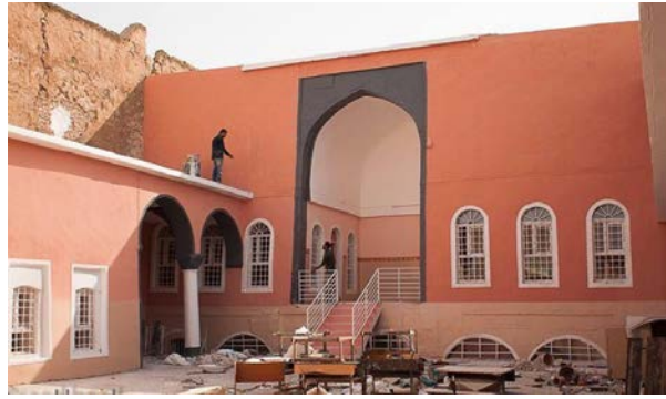
Figure 2: A sample of restored heritage houses in Old Mosul City (Alsenjary, 2018).

From Figures 1 and 2, the problem is identified clearly. The shifting in materials, colors, details, and design of the interior skin of the heritage houses in Old Mosul City will lead to the extinction of the original image of the traditional and heritage city. The working on interior design should follow the exterior design theme and vice versa. The integration between interior and exterior layout impacts the original image of the heritage house and the image of the alleys, and the city in total. Some studies mentioned the importance of the integration between the existing urban systems and conservation plans, which include the construction, rehabilitation, and development of the buildings, streets, and urban fabric (Fakhouri & Haddad, 2017).